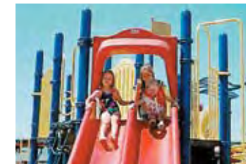
Playground fun at Richardson Park

Lane County Parks includes 4,600 acres of land, but perhaps more notable is that its 71 recreational sites are spread across a diverse expanse of Western Oregon. The ampleness of the region and the variety of things to do are not lost on residents or visitors. A limitless number of possibilities can be explored on a weekend escape or a mid-week getaway. The close proximity of destinations like Orchard Point and Baker Bay Parks give local residents the luxury of knowing they can quickly escape summertime heat with a cool dip in the lake or a relaxing shoreside picnic. Eighteen reservable group picnic areas in Lane County provide space enough to handle crowds and still not feel crowded. Most of the larger county parks also have plenty of swimming areas, picnic tables, game and children's play areas, as well as being accessible to the disabled.