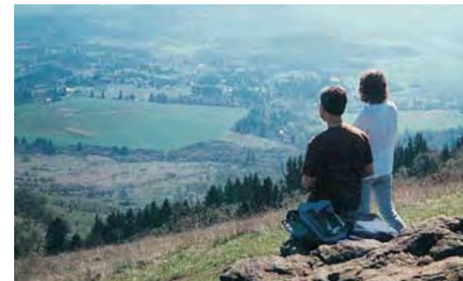
Mt. Pisgah Summit at Howard Buford Recreation Area

Volunteers are a vital workforce in Lane County Parks. Adopt-a-Trail and Adopt-a-Park programs are popular with many organizations, while special and/or individual project opportunities abound for others. Contact us for more information about volunteering in Parks.