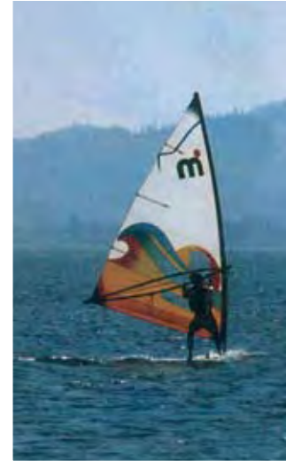
Sailboarding on Fern Ridge

Baker Bay Park, on Dorena Lake near Cottage Grove, plays host to sailboats as well as other watersports. You'll generally find more Hobie Cats populating the lake than the larger sailboats. Jet skis and power boats often tow waterskiers and tubes, lending their share of excitement to family outings as well. The lighter wind conditions and the shape of the lakes at Dorena and Fern Ridge make them ideal for beginning sailors. If you don't own a boat or a sailboard, don't let that stop you. Inflatables and sailboats are available for rental at Baker Bay and Orchard Point. Baker Bay rentals also include paddle boats, canoes, windgliders, and fishing poles with all the amenities. Kayak rentals are available at Perkins Peninsula Park. Call for availability and conditions.