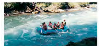
Rafting on the McKenzie River

Hendricks Bridge Park is located 7 miles east of Springfield along the McKenzie. With its two-lane boat ramp, it is a well known put-in and take-out spot for drift boat and raft enthusiasts. The park's nature trail, swim area, and one reservable picnic area have also made it a popular stop for residents and travelers alike.