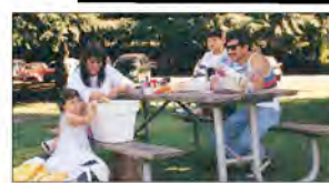
Family picnicking at Armitage Park

Armitage Park borders on the beautiful, and according to experienced fishermen, the beautiful McKenzie River. Its close proximity to Eugene and scattering of lofty old-growth maple trees within the 50-acre park have made it a traditional gathering spot for large family and company picnics. Eight reservable picnic sites.