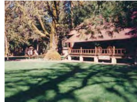
Historic Camp Lane

Nestled along the Coastal Mountains in the old growth timber and bordered by the Siuslaw River is Camp Lane. Large groups and organizations find it the