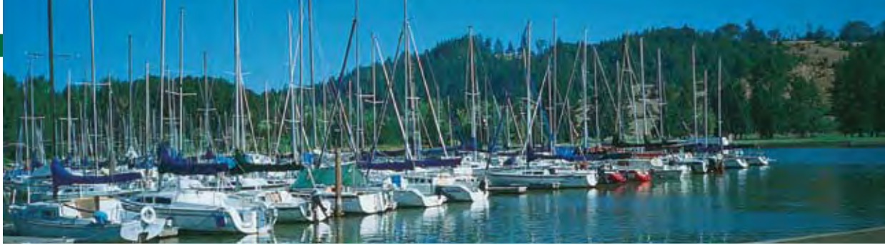
Richardson Park Marina

Lane County's rivers oblige those drawn to the heart-pounding descent down whitewater rapids; as well as those who prefer the serenity and romance of fly fishing along a beautiful unspoiled stretch of river. Visitors frequently testify that their driftboat excursion down the McKenzie complete with a lunchtime stopover for an entree of rainbow trout and topped off with an exhilarating pass through Martins Rapids, provides memories worthy of lasting a lifetime. Lane County's rivers and streams are a popular destination for fun and frolic - or just good fishing.