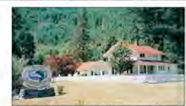
Historic McKenzie Fish Hatchery Info. Center